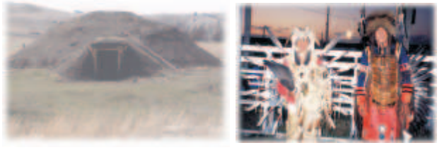
Ponca Earth Lodge Niobrara Native American Dancers

Santee Sioux Pow Wow - Held in June at Santee Ponca Pow Wow - Held in August at Niobrara