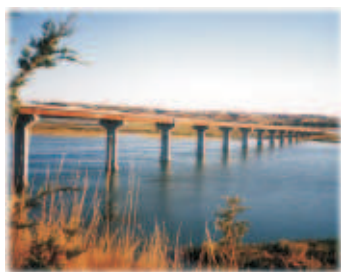
Chief Standing Bear Bridge Niobrara